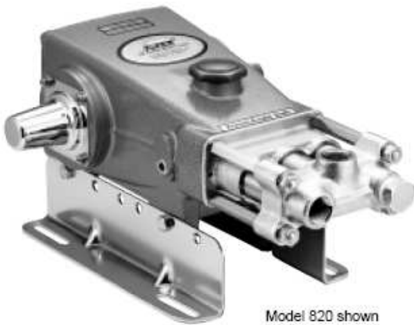
Model 820 shown