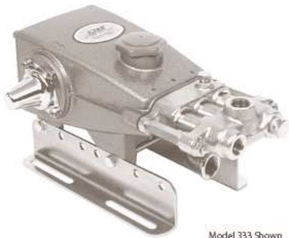
Model 333 Shown